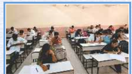
MBA - MCA CET - 'Mock Test'