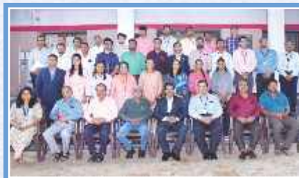
Dignitaries and participants of 'HR MEET - 2024' at IMS CAMPUS