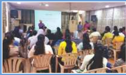
Administration Department conducting 'Orientation Programme for MBA - MCA Fresher's'