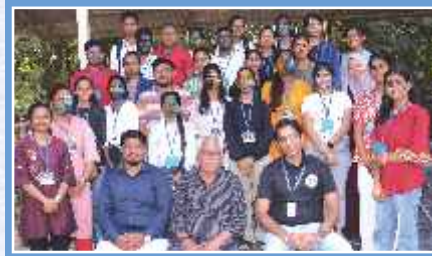
'Face Painting' - AAGNEYUM 2024