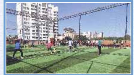
Inter Class Cricket Match