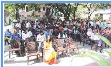
Audience at 'Antarrashtriya Matrubhasha Divas'