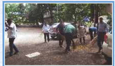
Campus Cleaning Drive 'Swachhta Hi Seva'