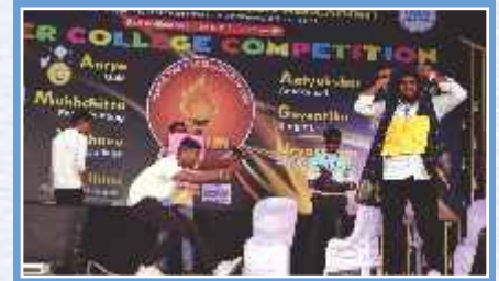
'Ad-Mad-Show' - AAGNEYUM 2024