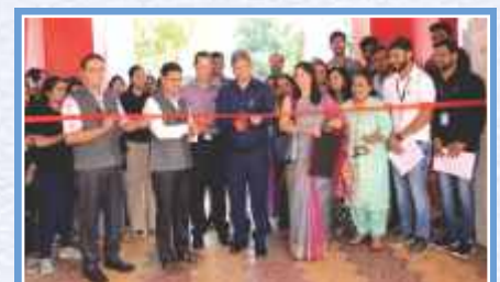
Dignitaries inaugurating 'Grand Diwali Mela' Women Entrepreneurs Expo