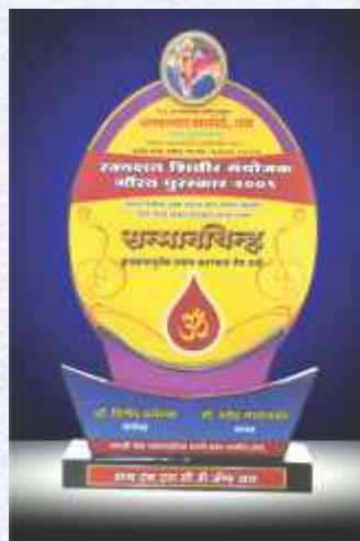
Jankalyan Blood Bank, Ahmednagar