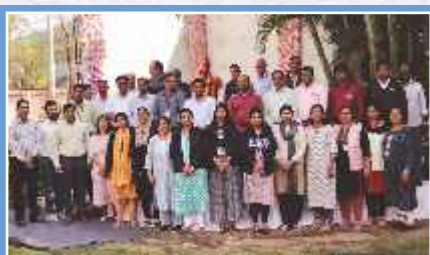
Founder's Day Celebration