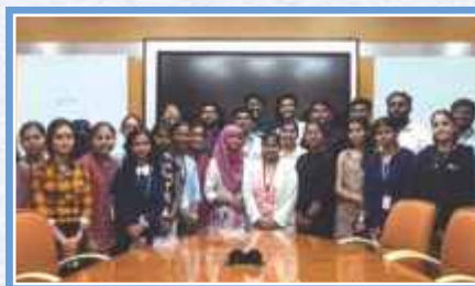
Industrial visit to 'Larsen & Toubro Limited., Ahmednagar'