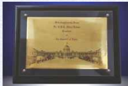
With Compliments from Dr. A. P. J. Abdul Kalam President of the Republic of India