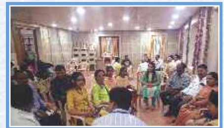
Parents - Teachers Meet