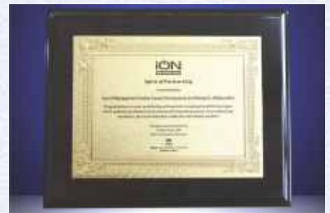
ION - TATA Consultancy Services