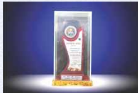
Alliance Club, Ahmednagar