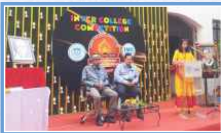
Celebration of 'Antarrashtriya Matrubhasha Divas'