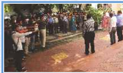
Faculty members, Staff and Students taking the pledge of 'Clean India - Green India'