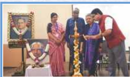
Dignitaries lighting the lamp during 'Author Speaks' programme