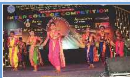
'Antakshari' - AAGNEYUM 2024