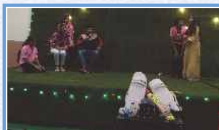
'Ad-Mad-Show' - Management Games 2023