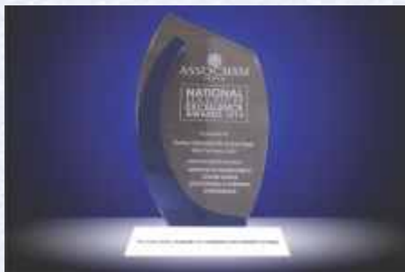
'Most upcoming B-School Award'