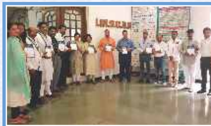
Release of 'Indian Journal of Current Trends in Management Sciences - 2023'