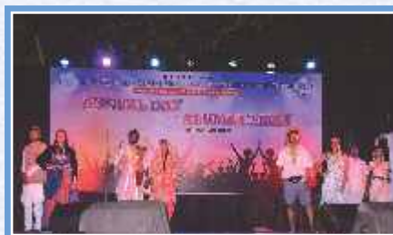
'Fashion Show' - Annual Day 2024