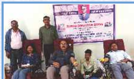
'Blood Donation Drive' on the occasion of 'Founder's Day'