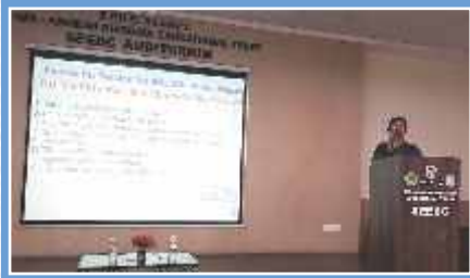
Library Orientation Programme for MBA students