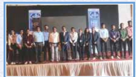
MBA HR Students during MCCIA organized 'HR Conclave 2024'