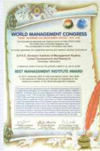
'Best Management Institute Award' WORLD MANAGEMENT CONGRESS