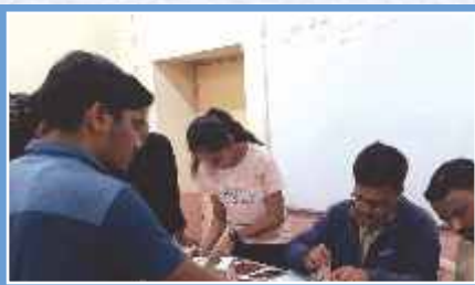
Account opening drive in 'Indian Post Payment Bank'