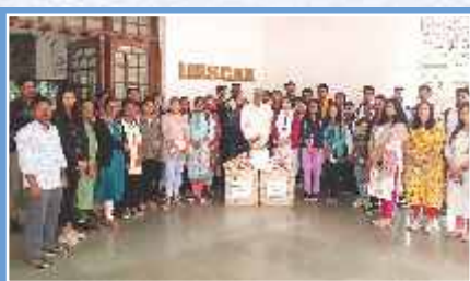
Christmas Donation Drive