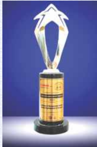
'Award for Leadership in IT Education'