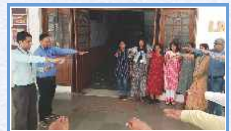
Faculty member and Staff taking the pledge of 'National Unity Day'