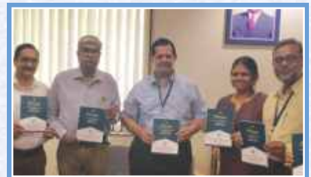
Release of IMS - Students Research Journals 'Prayas'