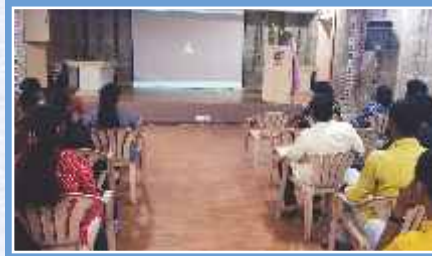
Library Orientation Programme for MCA students