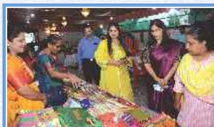
Stalls at 'Raksha Bandhan Special' Women Entrepreneurs Expo