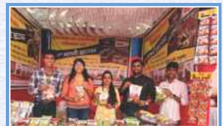
'FOODIE Mela' - 2024