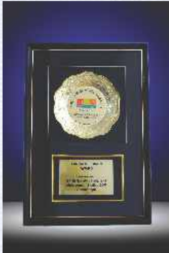
B-School Library Award