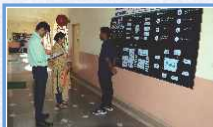
'Board Presentation' - IT WAVES