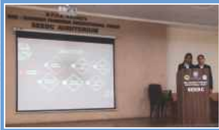
Students presenting 'Business Plan'