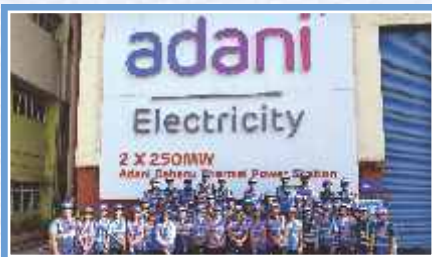
Industrial visit to 'Adani Thermal Power Station'