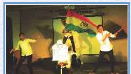
'Group Dance' - IT WAVES