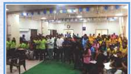
'Mock Stock' - Management Games 2023