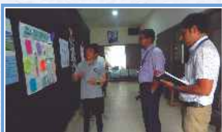
'Poster Presentation' - IT WAVES