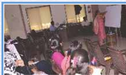
Workshop on 'MAH-MCA-CET'