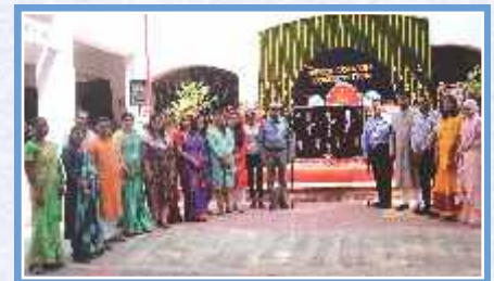
Display of 'Bookmark Competition'