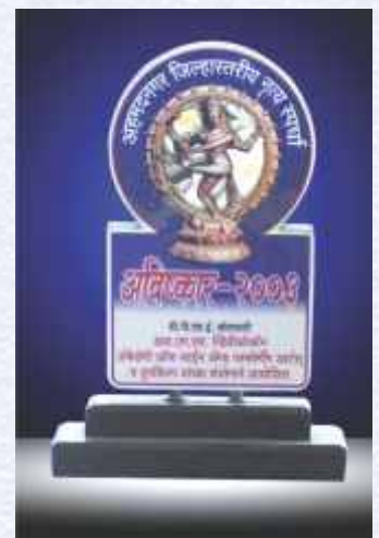
Avishkar - 2003