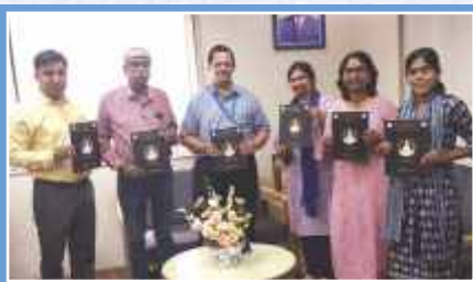
Release of 16 th volume of IMS - Student's Magazine 'Reflections'