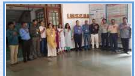
Taking pledge of 'Meri Mitti - Mera Desh'