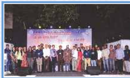
Alumni Meet 2024