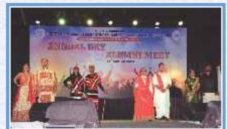
'Fashion Show' - Annual Day 2024