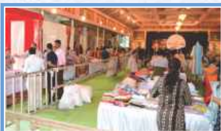
Stalls at 'Grand Diwali Mela' Women Entrepreneurs Expo