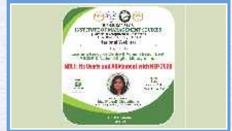
Webinar on NDLI : Usage and Alignment with NEP 2020