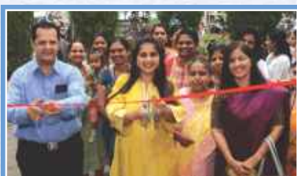
Dignitaries inaugurating 'Raksha Bandhan Special' Women Entrepreneurs Expo