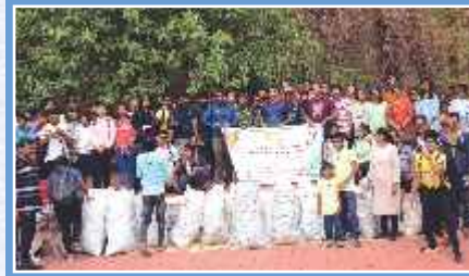
'Plogging Drive' under Unnat Bharat Abhiyan