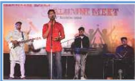
'Cultural Programme' - Annual Day 2024