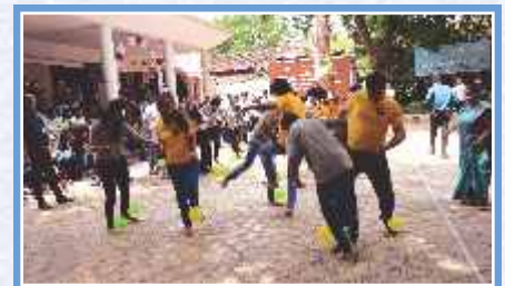
'Team Games' - IT WAVES