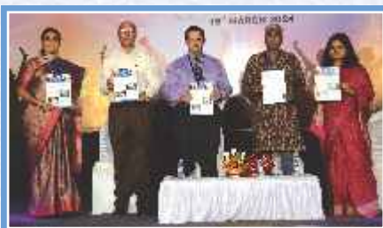
Release of 'IMS - Newsletter'