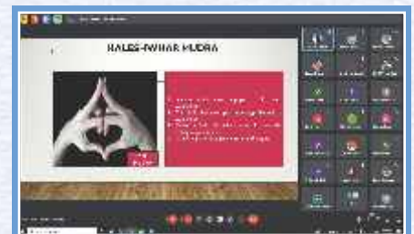
Celebrating 'International Day of Yoga'